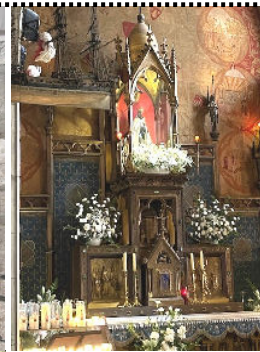
Chapel of the Black Madonna