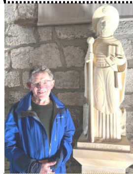
Image in Rocamadour church of St James