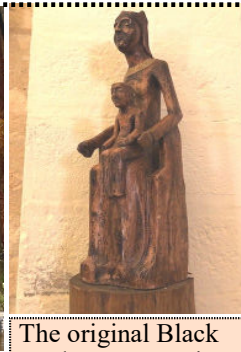
The original Black Madonna statue in Rocamadour