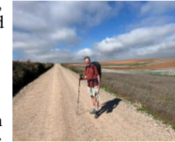
A Roman road - covered over with gravel

Dear Parishioners, my birthday this past week reminded me that I am getting old! I am blessed still to be able to walk the Camino. Along the way, we are constantly reminded of the antiquity of Europe, as we pass centuries old churches, buildings and remnants of city walls, and walk on roads laid by the Romans. But a problem comes with this: people and clergy seem stuck in "the ways we've always done it". The result is that the Church has lost its relevance to