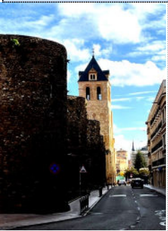
Remnant of Roman wall around city of Leon