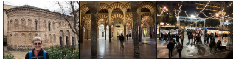
Left to right: The mezquita in Toledo—a mosque reshaped into a church; The Toledo cathedral where Islamic arches guide the way to the altar; Christmas stalls outside the cathedral in Barcelona.